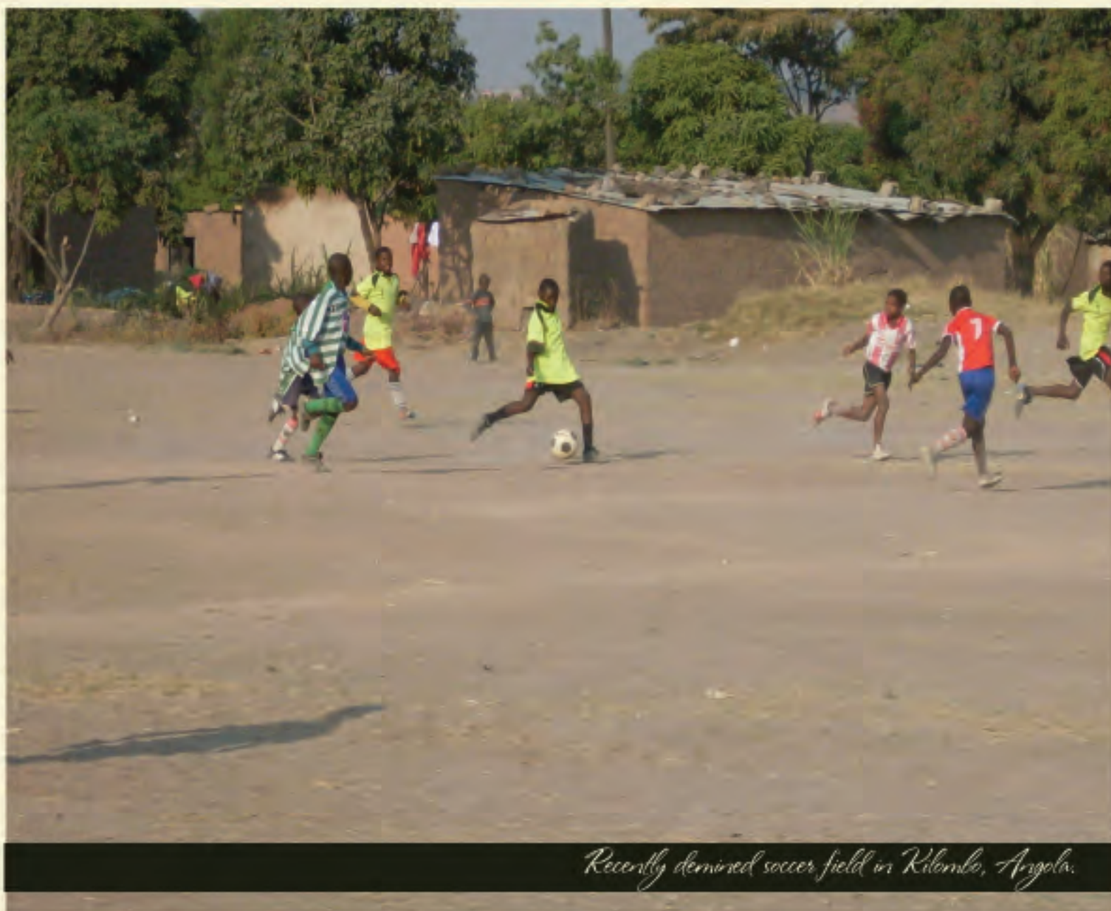
Recently demised soccer field in Kilombo, Angola.