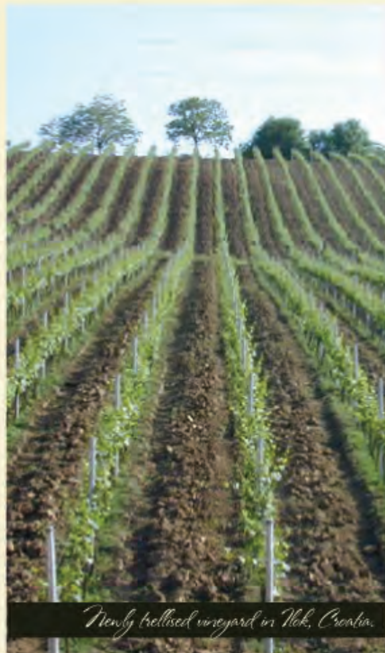
Newly trellised vineyard in Plak, Croatia.