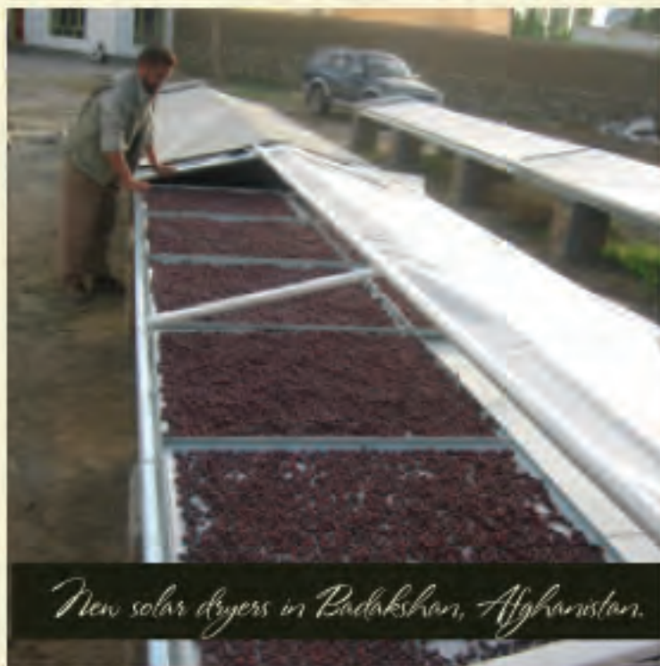
New solar dryers in Badakhshan, Afghanistan.

ROP is working in partnership with the Ministry of Agriculture and Irrigation to lead a three-year project to promote sustainable commercial agriculture with farmers, agri-processors, and traders for more profitable production, processing, and marketing industries.