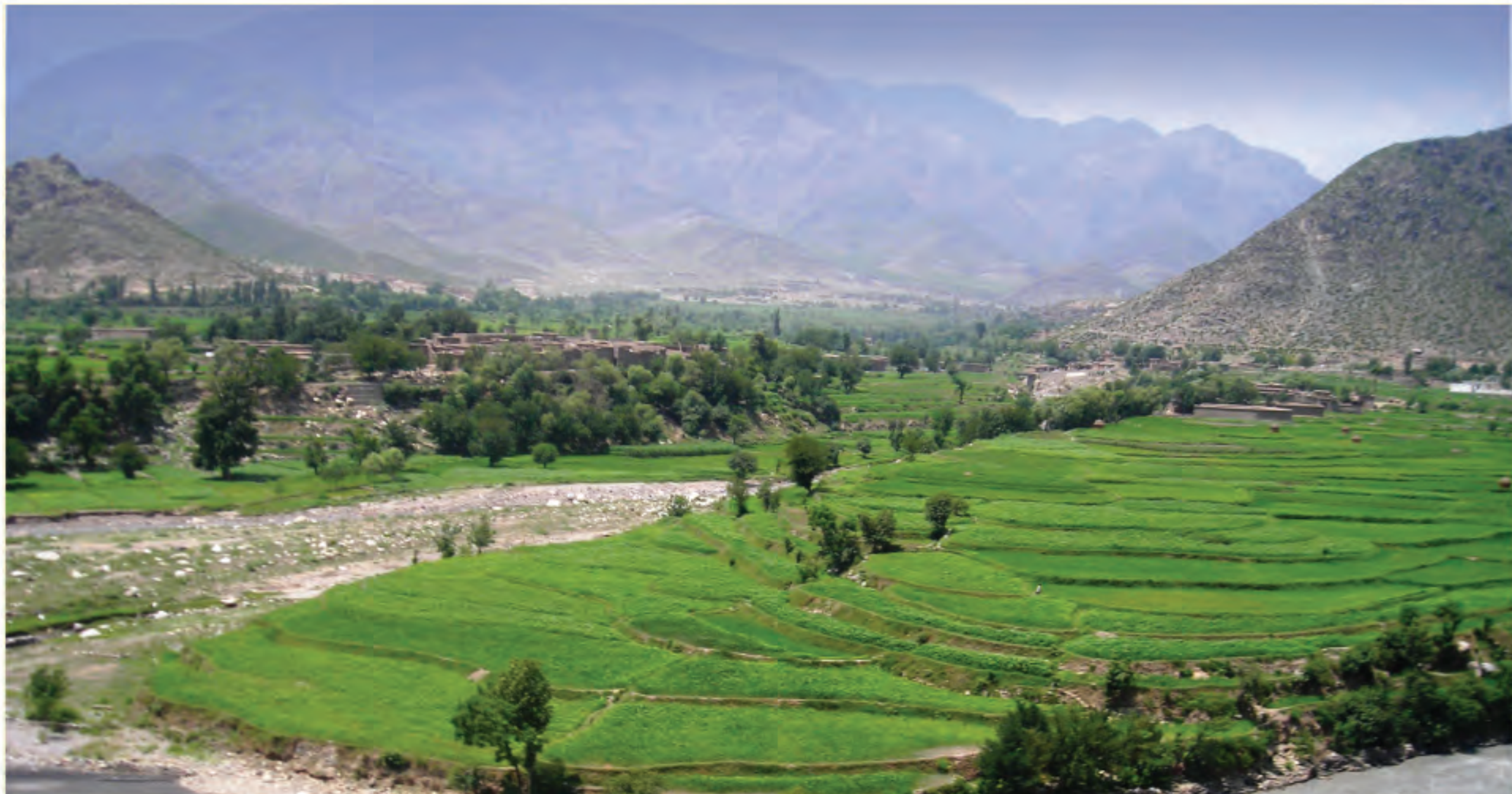
Successfully terraced winter wheat and vegetable fields in the Shomali Plains located on a former battle line of the Taliban vs. Masoud's Forces conflict.