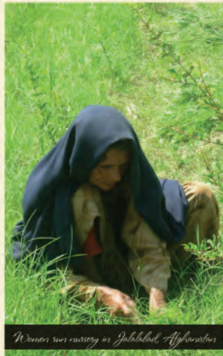
Women run nursery in Jalalabad, Afghanistan