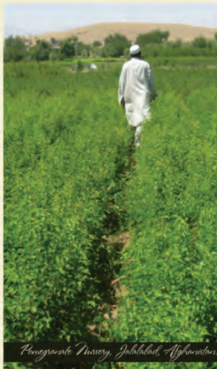
Pomegranate Nursery, Jalalabad, Afghanistan.

ROP has now established financial policies and procedures to better manage expansion. New IT systems including human resources and a donor database were implemented during the year. During 2007, ROP established reserve accounts for future programs. At the end of 2007, ROP had set aside $88,601 for demine/rebuild projects that will take place during 2008.