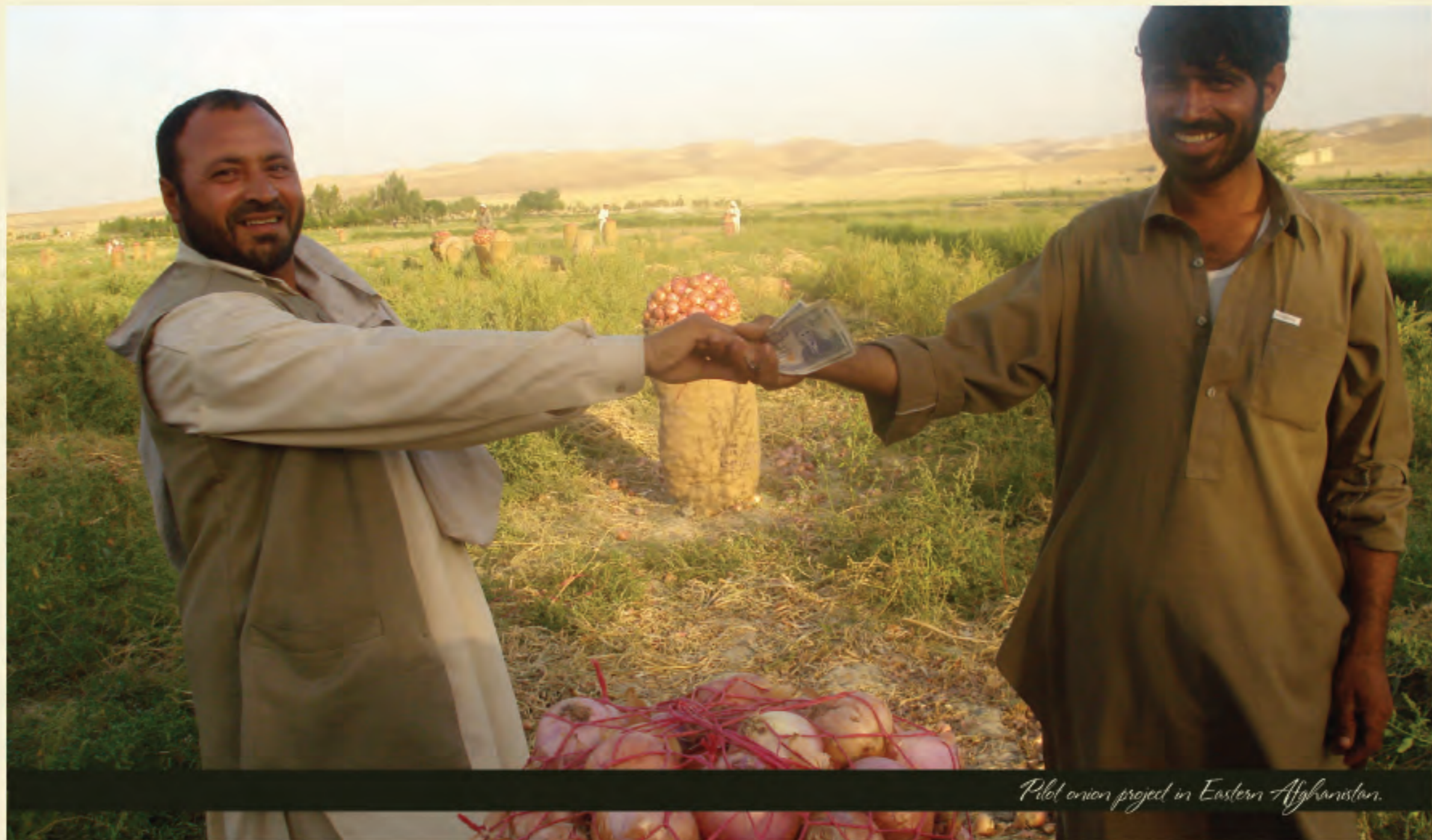
Pilot onion project in Eastern Afghanistan.