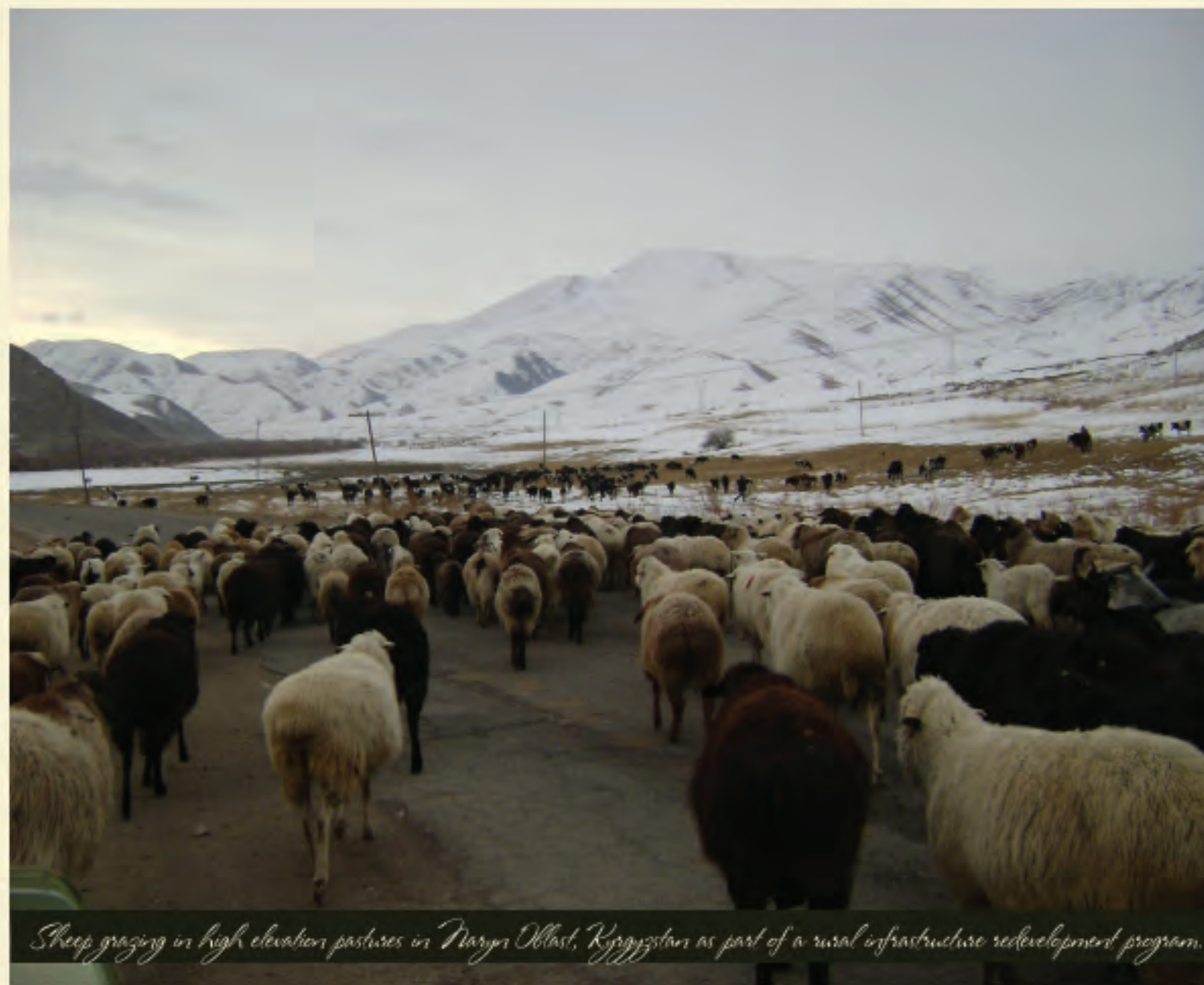
Sheep grazing in high elevation pastures in Naryn Oblast, Kyrgyzstan as part of a rural infrastructure redevelopment program.

ROP led a large consulting Team in designing the Asian Development Bank –funded Agricultural Land Improvement Project in the northern provinces of Kyrgyz Republic from October 2007 until February 2008. The Team, consisting of crop, livestock, agribusiness, pasture, irrigation and rural infrastructure, environmental, institutional, financial, gender and rural sociology specialists, assessed the current use and management of the land and water resources and developed alternative approaches for addressing the agricultural developmental constraints and opportunities. This design project exemplifies the effort ROP is making in expanding its mission into other countries and regions that are prepared to increase rural incomes and improve land productivity.