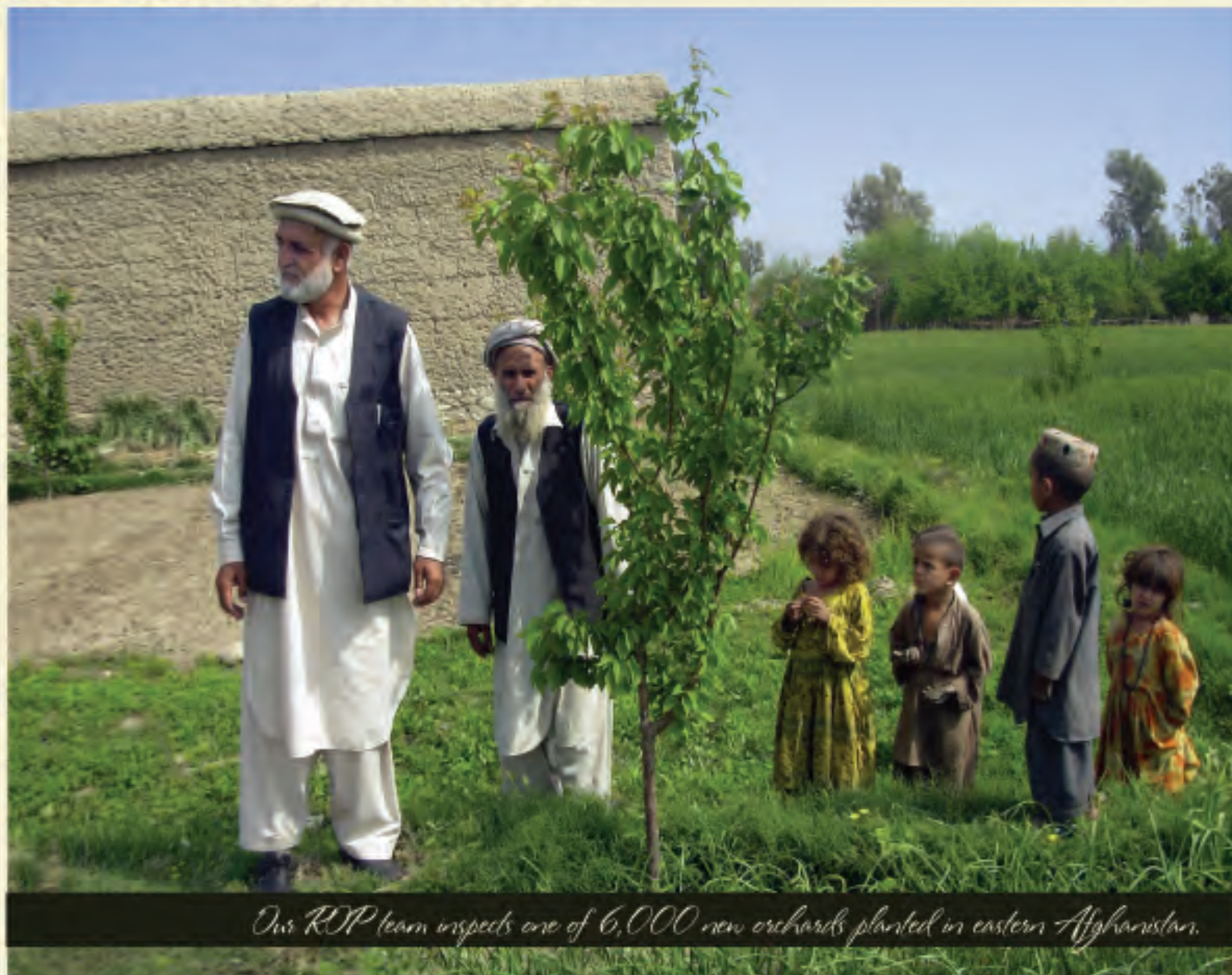
Our ROP team inspects one of 6,000 new orchards planted in eastern Afghanistan.

THE INNOVATIVE DEMINE-REPLANT-REBUILD MODEL OF ROP OFFERS A COMPREHENSIVE APPROACH TO RESTORING RURAL AGRICULTURAL COMMUNITIES TO ECONOMIC SELF-SUFFICIENCY. ROP FOCUSES ON POST-CONFLICT COUNTRIES WHERE AGRICULTURE IS A FUNDAMENTAL INDUSTRY AND MAJOR SOURCE OF EMPLOYMENT. OUR DEMINING PROGRAMS CLEAR LANDMINES AND REMNANTS OF WAR FROM FERTILE FARMLANDS, AGRICULTURAL INFRASTRUCTURE, AND ROUTES TO MARKETS SO FARMERS CAN WORK THEIR FIELDS, PROCESS THEIR CROPS, AND SELL THEIR PRODUCE SAFELY. OUR REPLANT AND REBUILD PROGRAMS FOCUS ON THE ENTIRE VALUE CHAIN AND PROVIDE TECHNICAL ASSISTANCE, WHERE NEEDED, TO FARMERS, PROCESSORS AND TRADERS. WE HELP THEM MEET THE DEMANDS OF LOCAL, REGIONAL, AND INTERNATIONAL MARKETS IN ORDER TO MAXIMIZE THEIR INCOME. THIS BENEFITS LARGE NUMBERS OF SMALLHOLDER FARMERS WHILE STIMULATING SERVICE AND SUPPLY INDUSTRIES SUCH AS TRADING, CREDIT, PROCESSING, DISTRIBUTION, AND AGRICULTURAL INPUT SUPPLIERS.