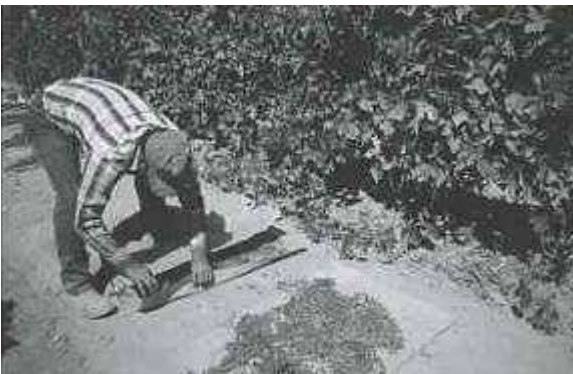
Fig 1. Turning trays help to even drying.

Turning is not always an essential operation. Turning is a way to mix the grapes on the tray to facilitate faster and more even drying. Turning is necessary in the following situations: with clusters that are too large to avoid the inclusion of an excessive amount of green, un-dried berries; with late harvests or slow drying conditions such as cool weather or north-south rows; with heavy trays or trays in which some rot is progressing in the bottom-most fruit; or after a rain. Turn when the berries on the top layer are brown and shriveled.