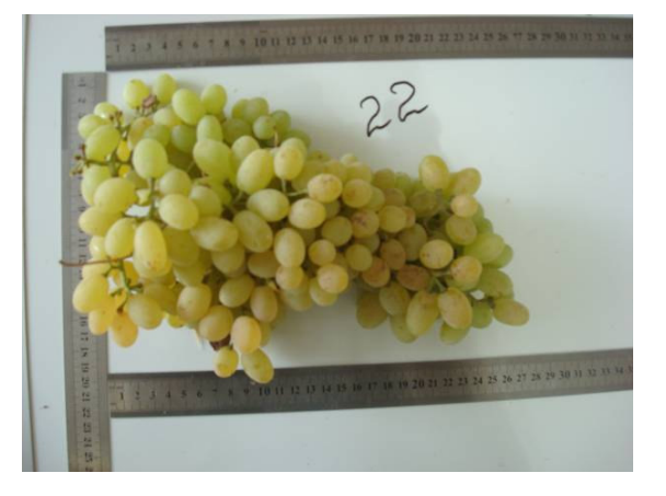
Treated with GA3 at 60 ppm