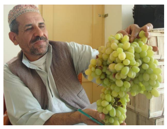
Figure-4:Keshmeshi grape treated with