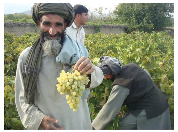
Figure-3: Keshmeshi grape treated with GA3